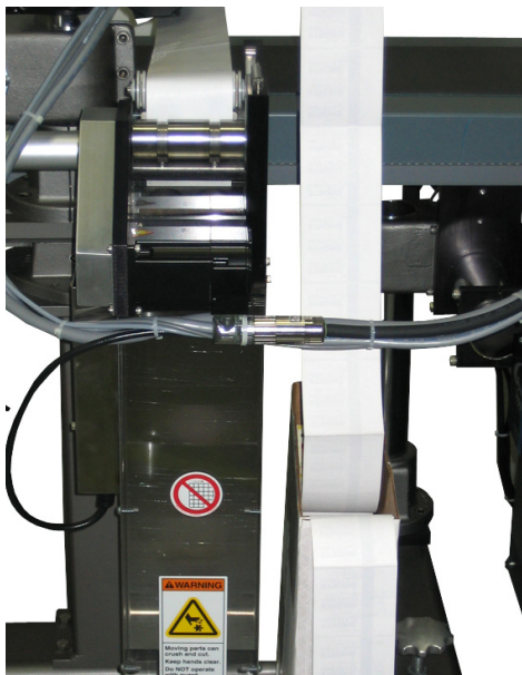
Waste Disposal System